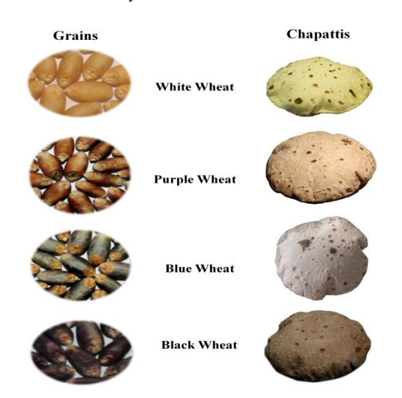
Figure 1. Seeds and chapatti of white and different colored wheat.

Seeds and chapatti of different colored wheat lines are shown in Figure 1. Their detailed physicochemical, antioxidant, and sensory characteristics are as follows.