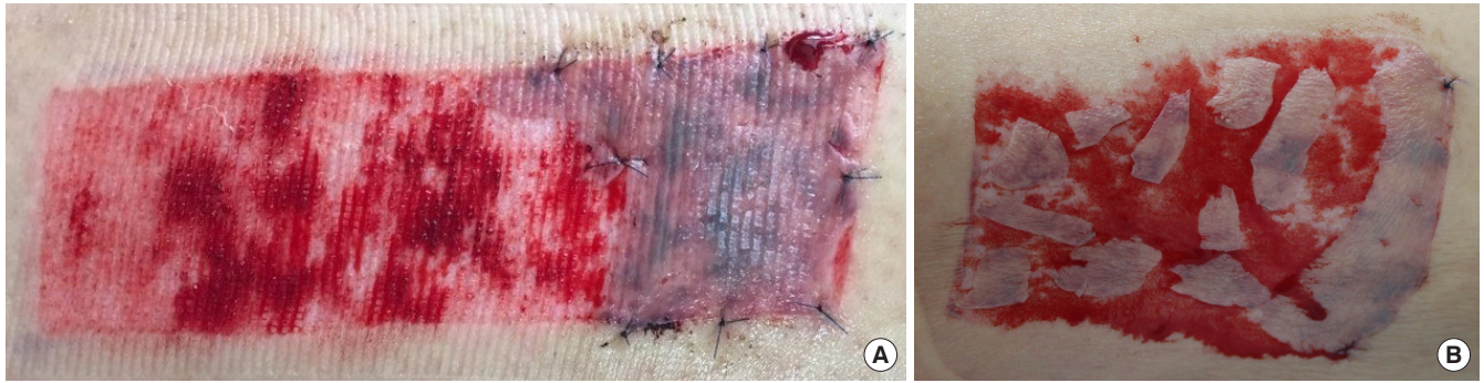
Fig. 1. Photographs of remnant skin immediately regrafted after split-thickness skin graft. (A) Large remnant skin regrafted onto the donor site in the single sheet type. (B) Multiple pieces of the remnant skin regrafted onto randomly selected areas at the donor site in the island type.