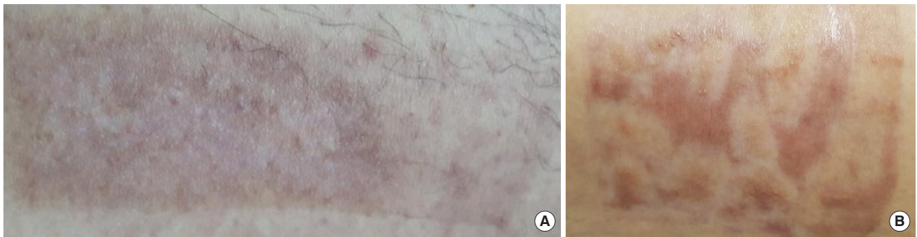
Fig. 4. Scar formation in each group 3 months after split-thickness skin graft. (A) Single sheet and (B) island types.