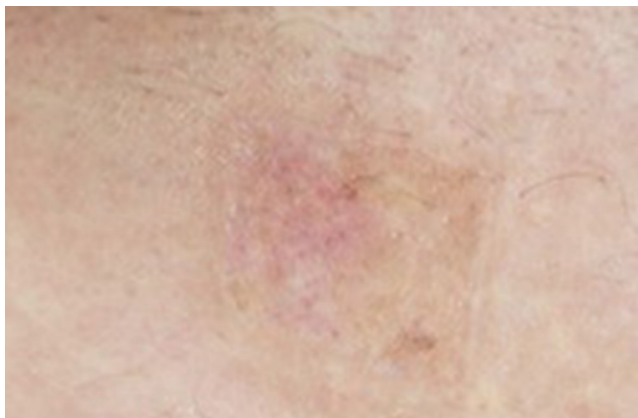
Fig. 5. An island type donor site 6 months after the graft procedure.

a) Comparison of the score between the two groups (Mann-Whitney U test); b) Wilcoxon signed-rank test; c) p < 0.05.