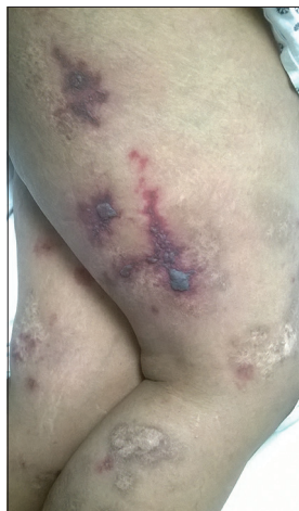
Figure 1: Retiform, violaceous necrotic purpuric lesions with overlying bullae and healed old scars on the right thigh

P-ANCA: Perinuclear antineutrophil cytoplasmic antibody; MPO: Myeloperoxidase; C-ANCA: Cytoplasmic antineutrophil cytoplasmic antibodies; PR3: Proteinase 3; SS-B: Sjögren’s syndrome type B