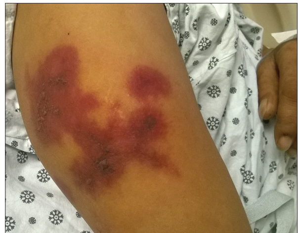
Figure 2: Retiform, violaceous necrotic purpuric lesions with overlying bullae on the right arm