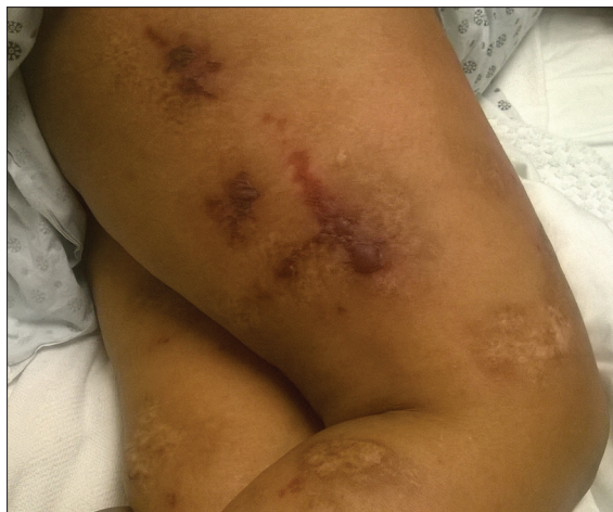
Figure 5: Improvement of necrotic areas and redness on the right thigh 72 h after steroid treatment and cessation of cocaine