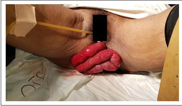
Figure 1. Eviscerated small intestinal loops through anus.

She had three uncomplicated vaginal deliveries in the past. On examination, she was found to have evisceration of the small bowel through the anus rather than a rectal prolapse, without any macroscopic evidence of strangulation (Figure 1). There was associated uterovaginal prolapse and perineal descent suggestive of pelvic floor dysfunction. She was hemodynamically stable with normal blood pressure and heart rate. Her biochemical investigations including serum lactate were all normal. Emergency laparotomy was performed and the small bowel was reduced into the abdomen with ease. She was found to have a linear tear, 6 cm from the anal verge on the anterior wall of the middle part of the rectum without any macroscopic evidence of ischemia or neoplasm (Figure 2). The reduced small bowel was normal in appearance with good peristalsis. Primary repair of the rectal defect was carried out after obtaining a biopsy from the rectal tear and a proximal defunctioning ileostomy was created. Histological examination of the rectal biopsy was unremarkable. She was managed in the intensive care unit for 2 days post-operatively and had an uneventful recovery. The patient was discharged on the fifth post-operative day.