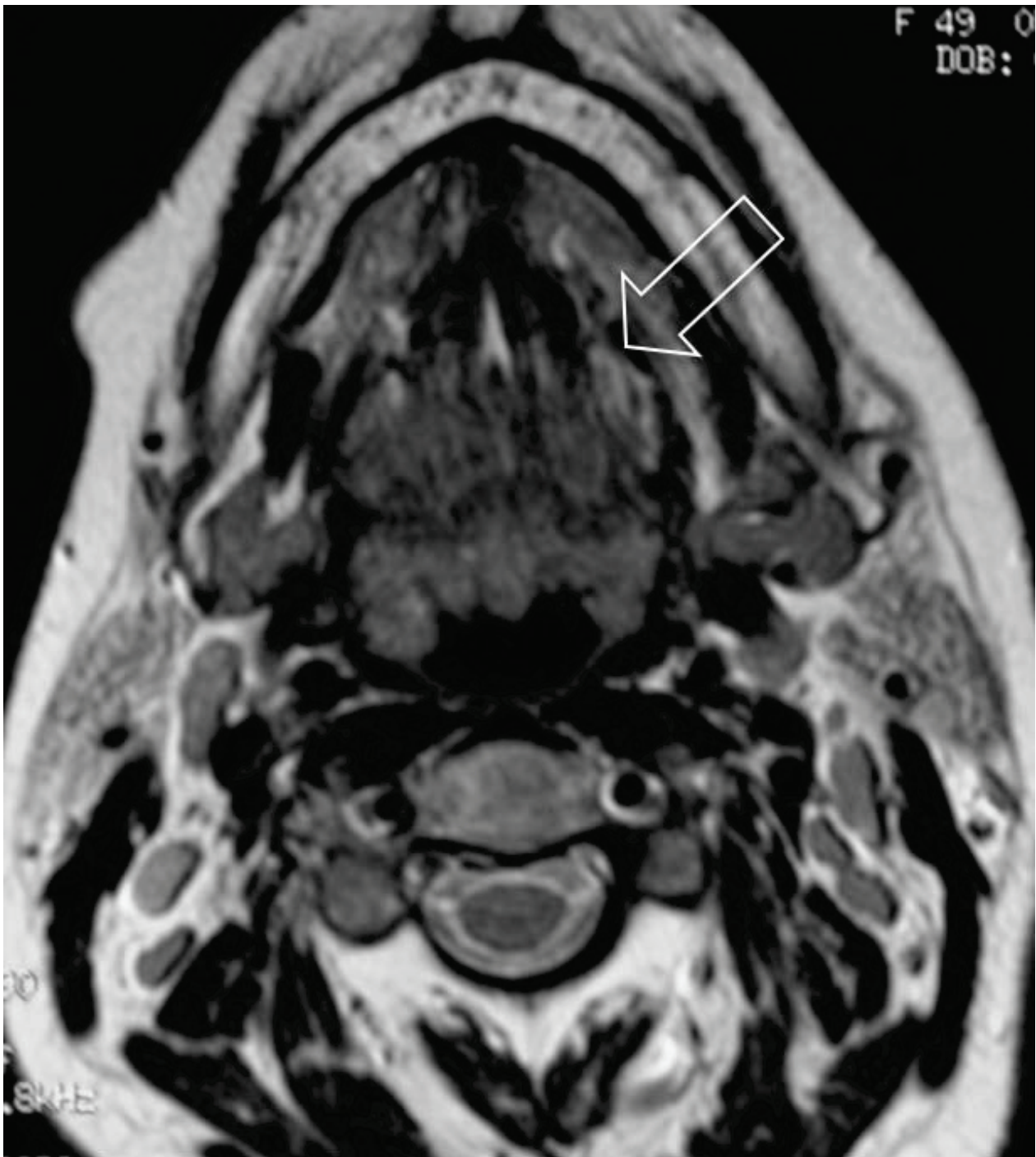
Figure 2 Tongue magnetic resonance image showing the neof ormation (arrow).

only eight occurred on the tongue. After the biopsy, all patients did well. Recurrence after partial or complete excision of lesions has been reported in previous studies [12].