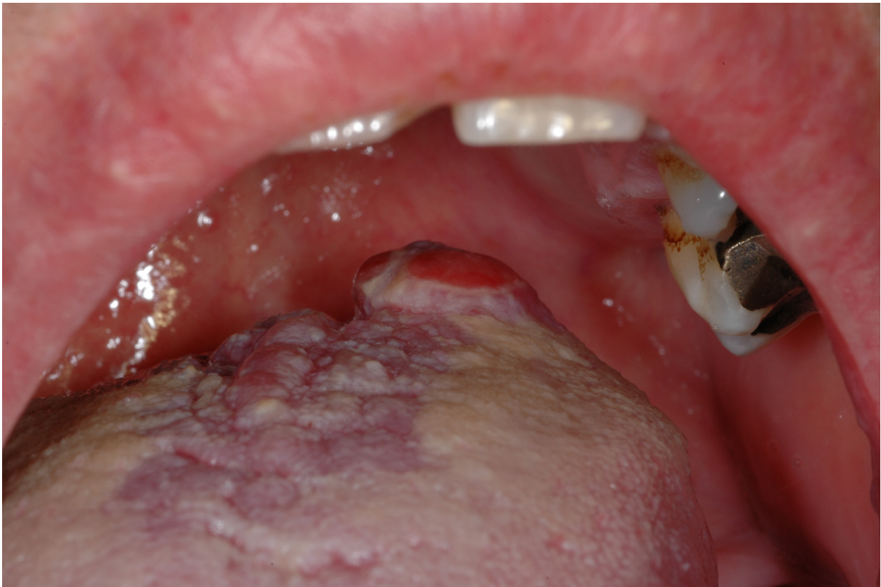
Figure 1 Clinical presentation of the lesion.

Her medical history was uneventful, except for breast cancer several years earlier, and included no history of smoking or drinking.