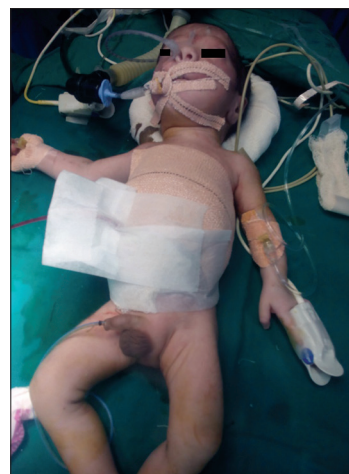
Figure 2: After surgery

The authors certify that they have obtained all appropriate patient consent forms. In the form the patient(s) has/have