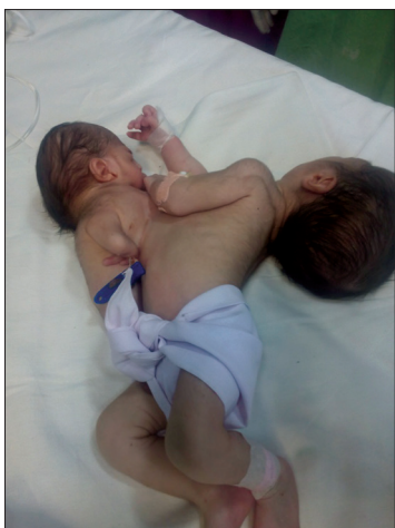
Figure 1: Before surgery

Surgery should better be delayed till 6–12 months of age, as physical maturity is associated with better outcome. Surgeries done in neonatal period is very risky carrying a mortality rate of 50%. [7] However, in our case, one of the twins was parasite over the healthy one with connecting hearts and common liver; so as to save the healthy child we planned early separation.