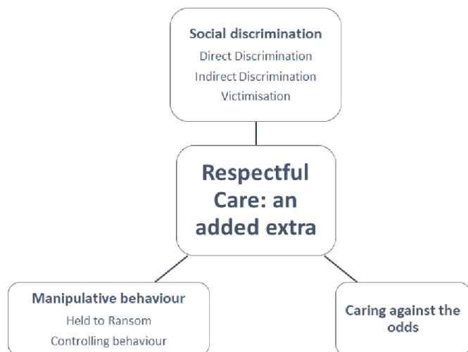
Figure 2 Core category, major categories and sub-categories.

communal areas). Health-providers and stakeholders were mainly interviewed at their workplace. Interviews lasted between 20 and 120 min. Table 1 presents participant characteristics. Additionally, 11 influential stakeholders were interviewed: all six stakeholders in Tanzania were male; in Zambia two were female and three were male. Stakeholders comprised religious leaders, village chiefs and policy makers.