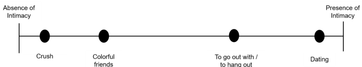
Figure 2. Spectrum of the representation of intimacy in love relationships between adolescents.

Similar to the representation of commitment variation in intimacy relationships between adolescents, a broad spectrum concerning intimacy has been performed. This involves the sharing of the inner and outer self, a self-revelation as it is conceived in the expression “involves the things that we only share with people . . . with which we feel comfortable to say or show what we should not show others at first” (FG5), to expose the “insecurity and personal things to the other” (FG4). Regarding the adolescents, for them to have intimacy there must be trust in the other person, as well as respect to feel at ease once “intimacy is the part of the private relationship with the two people” (FG5). Adolescents report that there is no intimacy in a crush, while it can already be perceived and expressed among colourful friends and is present when referring to dating. It is also mentioned that “in friends with benefits there is only physical intimacy, while in other relationships there is emotional intimacy” (FG5). According to them, this component of intimate relationships depends on the type of relationship (Figure 2).