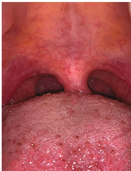
FIGURE 2: At eight-month follow-up visit, the yellow nodule in the left palatine tonsil completely disappeared.

In our case, the patient was in a very good health condition and did not complain of any abnormal signs or symptoms; the nodule had a distinct clinical appearance and was highly associated with LEC. LEC is an uncommon developmental, nonodontogenic cyst that was first described as a branchial cleft cyst in 1962 by Gold [10].