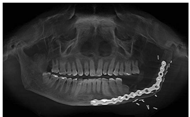
Fig. 4. Mandibular and condylar reconstruction by fibular flap and postoperative 2-year follow-up on cone beam computed tomography.