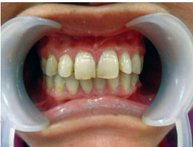
Fig. 2. Postoperative dental occlusion.