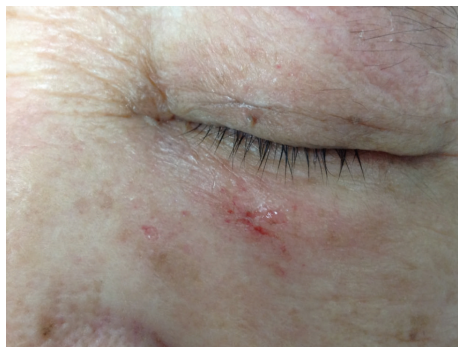
FIGURE 3: Example of skin denudation.

low levels of peel force are not always associated with low damage [21].