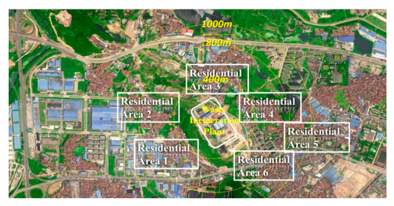
Figure 5. The location analysis of Guodingshan waste incineration plant.

The Guodingshan municipal waste incineration plant is surrounded by several residential areas. This is prohibited by national standards—Pollution Control Standards for Hazardous Wastes Incineration. According to the standards, the safe distance for waste incineration was set as 1000 meters before 2009. After 2009, it was adjusted to 800 meters, but the safe distance for the Guodingshan waste incineration plant was reduced to 400 meters by the local bureau of environmental protection. In Figure 5, we show three concentric circles which represent 400 meters, 800 meters and 1000 meters away from the waste incineration plant.