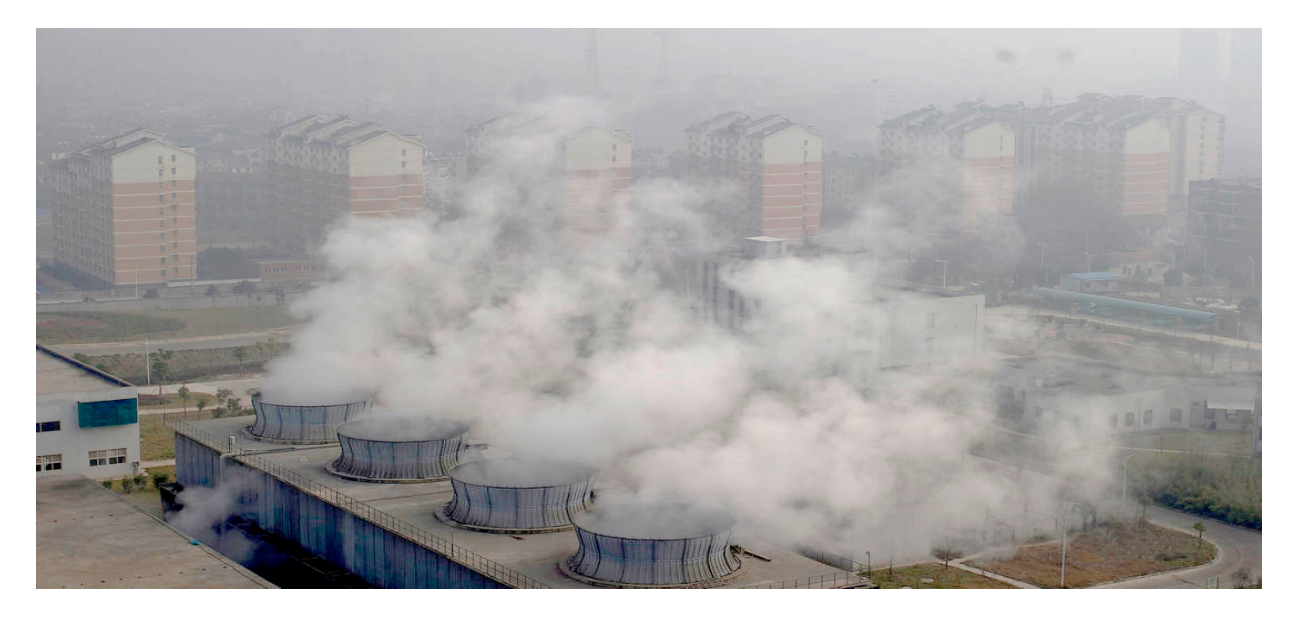
Figure 2. Guodingshan waste incineration plant with residential buildings nearby.

Various levels of governments in Wuhan pursue economic and political achievements unilaterally. They usually boost the GDP growth with investments in many fields, including waste incineration. Enterprises, in order to obtain maximum benefits, often collude with the EIAs and the governments to pass or even escape the EIA's evaluation. As a result, a prohibited plant ends up emitting excessive waste gas which damages the public interest (see Figure 2).