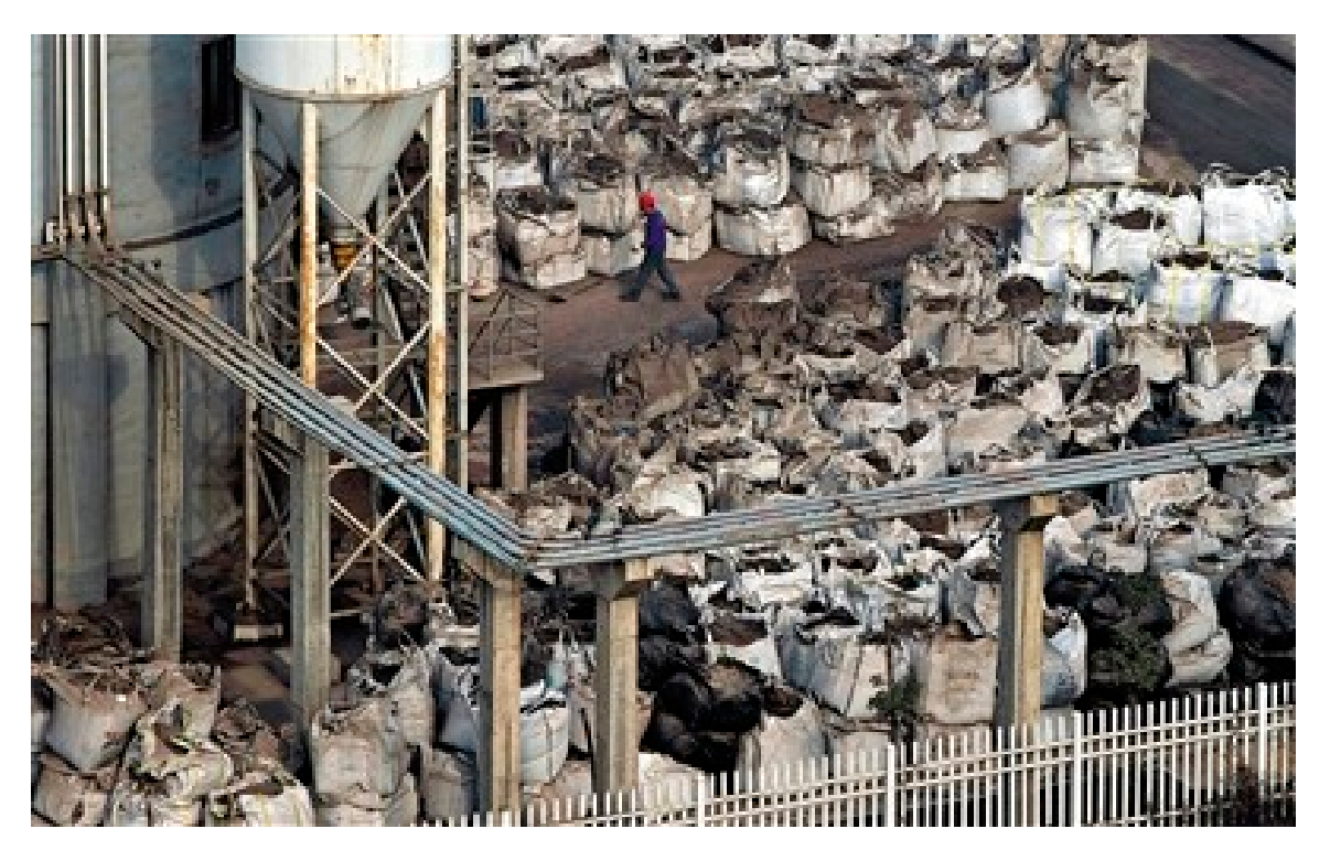
Figure 4. Fly ash in the open space of the Guodingshan waste incineration plant.

If the fly ash is not appropriately solidified, the numerous dioxins produced may contaminate the air, water and soil. Because of the low water solubility and long biological half-life of dioxins, even small concentrations in water and soil can become concentrated in the food chain to develop into levels dangerous to human health. In other words, the untreated fly ash is a dangerous pollutant and could seriously damage the public health.