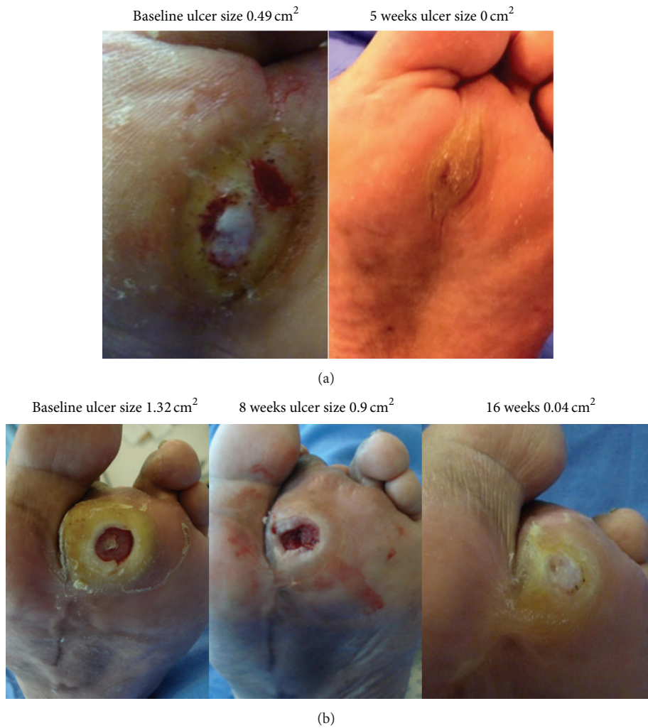
FIGURE 3: (a) Ulcer assigned to pirfenidone plus conventional treatment group during the first 8 weeks, that healed before crossover. (b) Ulcer assigned to conventional treatment only during the first 8 weeks, and crossover to pirfenidone plus conventional treatment.