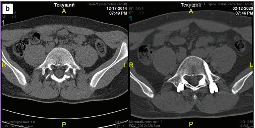
Figure 2. Clinical example of treating spondylolisthesis using minimally invasive technique: