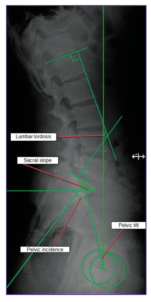
Figure 1. Angles of spinopelvic interrelationship (pelvic incidence, pelvic tilt, sacral slope, lumbar lordosis) on the radiograph

in 1970 [9] has been modified and described in the works of a number of other authors [10, 11]. It makes it possible to stabilize the segment and prevents the progression of slippage without its fixation. The main point of all proposed methods is to create prerequisites for the consolidation of the vertebral arch. And the fixation techniques within one vertebra vary from the compression with a screw to fastening with a wire. With the development of minimally invasive techniques, a low-traumatic approach to this type of surgical intervention has been also devised [12].