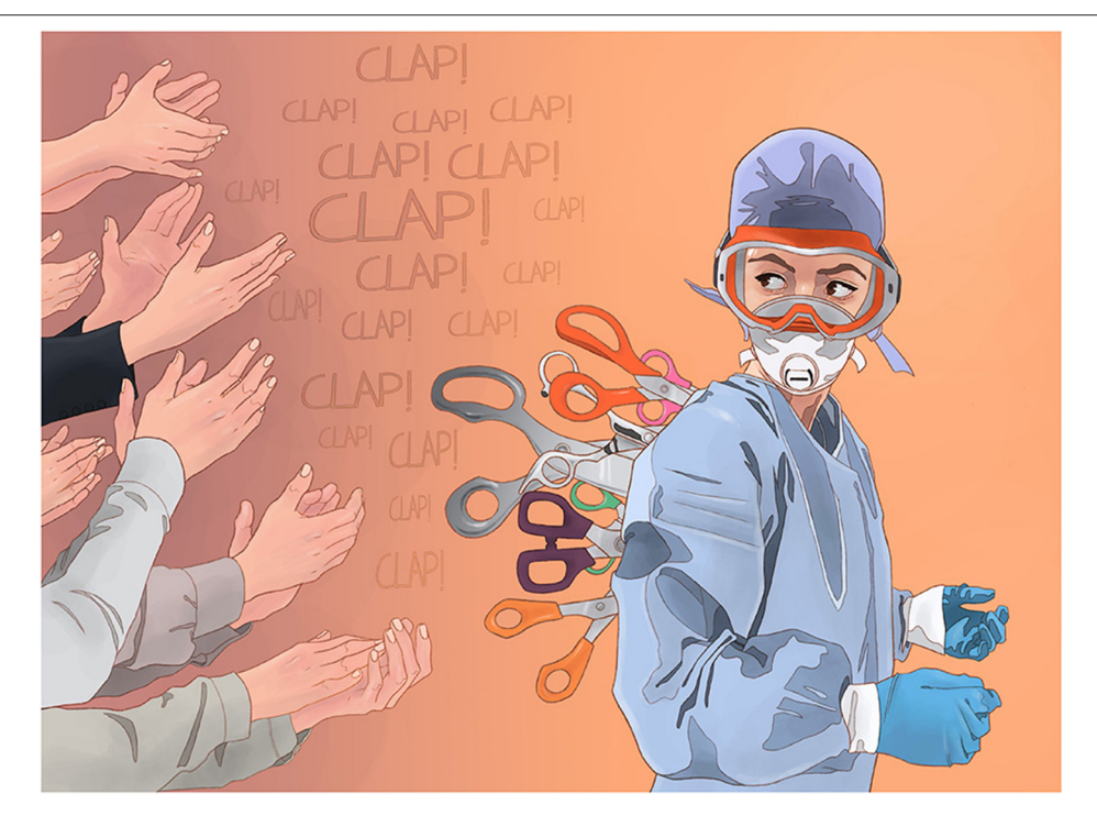
FIGURE 1 | Luis Quiles' work "Expendable Workers" (ca. April 2020) depicting the contradiction in words and deeds perceived by frontline workers in Covid-19. Reproduced by kind permission of the artist.