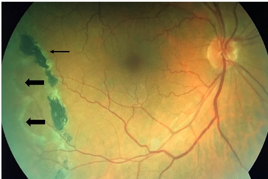
FIGURE 1: Fundus photo of the right eye showing senile retinoschisis at the inferotemporal quadrant (thick arrows), and barrage argon laser photocoagulation scar (thin arrow).

remainder of the retinal examination was unremarkable. Afterward, dilated fundus examination of the left eye was normal. On the other hand, B-scan ultrasonography of the right eye demonstrated dome-shaped elevations with high intensity while A-scan ultrasonography showed echo spikes. Therefore, SD-OCT was performed to rule out localized peripheral RD. SD-OCT was performed at the lesion and demonstrated attached retina with a wide separation of the neurosensory retina with splitting found at the outer plexiform layer, characteristic of SR (Figure 2). For treatment, a barrage argon laser photocoagulation was performed to surround the retinoschisis and prevent further extension (Figure 1). The patient was followed up regularly and the long-term follow-up after four years showed stable findings without any progression.