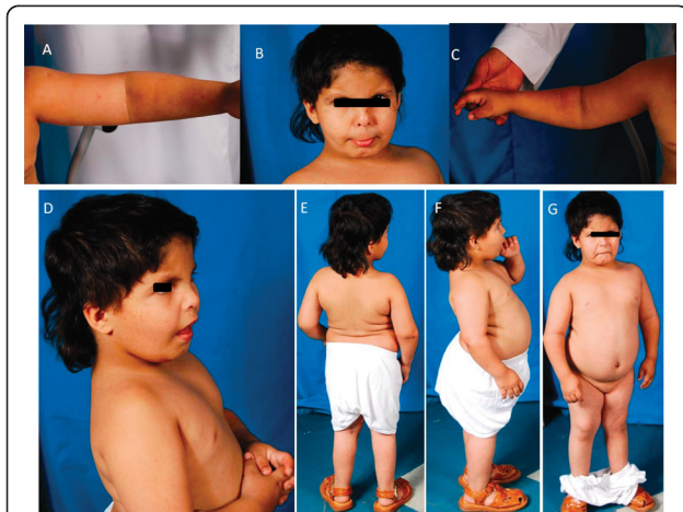
Figure 1 Patient photos. Photos showing the patient and clinical phenotypes: A) Left arm showing bent elbow, B) Face indicating long philtrum of upper lip, C) Right arm with bent elbow, D) Facial features including small ear lobe from left side, E-F) Full body indicating scoliosis, short stature, micro-retrognathia, respectively.

At 5 9/12 years of age his height, weight and head circumference were 83 cm, 13 kg and 47.5 cm. These represented the medians of 19/69, 24/69 and 14/69 respectively; and all were well below 3 rd percentile. He had micrognathia, small ears, impalpable testes, elbow deformity and kyphoscoliosis. He had a short and small penis in addition to the undescended testicles. The system examination including chest, heart, abdomen and central and peripheral nervous system were all normal. The blood count, renal and hepatic profile and other chemistries were within normal limits. The ECG was normal. A karyotyping and FISH examination for 22q11.2 region were normal. The diagnosis of panhypopituitarism was entertained. The IGF1 was 24 mEq/Lv. The TS and TSH were normal. Up to seven years of age, he showed poor speech, developmental delay and growth retardation; his height was 87 cm, at 2 years chronological age was 6 years. At present he is 10-year-old with no improvement in his clinical findings (Figure 1A-G).