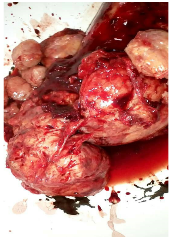
Fig. 2 Resected pieces of the tumor

Testicular seminoma is the most common malignancy in men. We managed a man who had an increasing mass in his lower abdomen with few associated symptoms. The absence of one testis from his scrotum was highly suspicious of a seminoma, despite the fact that he was fertile and had no relevant past history. Given the rarity