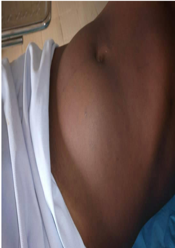
Fig. 1 Abdomen of patient showing projection of tumor above pubic symphysis to umbilicus

palpable inguinal lymph nodes or ascites. A neurological assessment revealed conserved muscle forces and sensitivity in all four limbs with all reflexes, particularly the cremasteric and abdominal reflexes, conserved. Paraclinical investigations revealed: no hematuria and proteinuria on urine analysis, normal white cell and platelet count on the full blood count, no blast cells on the blood smear, and a negative human immunodeficiency virus (HIV) serology. A pelvic ultrasound revealed a heterogeneous bean-shaped mass lying above his bladder, approximately 10 cm by 7 cm in size, with five smaller satellite masses. His kidneys, bladder, and bowels had no abnormalities. Given these findings, we had as a probable diagnosis, enlarged mesenteric lymph nodes.