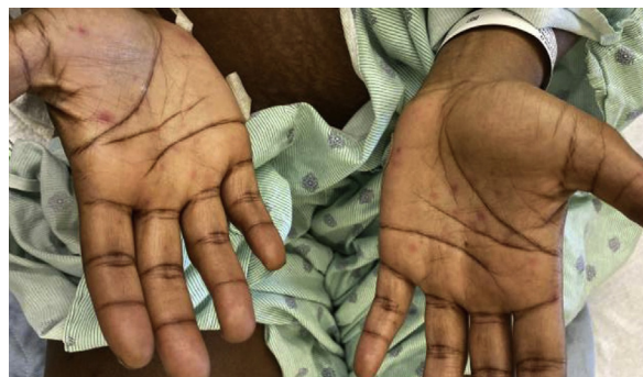
Fig 3. The patient developed erythematous papular erosions on the palmar surfaces of both her hands.