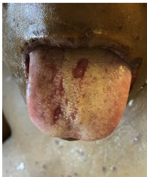
Fig 2. Oral mucosal erosions developed, which favored a Stevens-Johnson syndrome diagnosis.