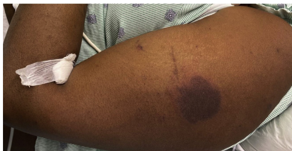
Fig 1. A dusky bulla was seen at the site of influenza vaccine administration, favoring the influenza vaccine as the culprit of Stevens-Johnson syndrome.