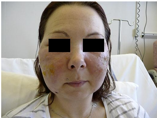
Fig. 1. Case 1. Facial erythematous edema covered by vesicles and yellowish crusts.