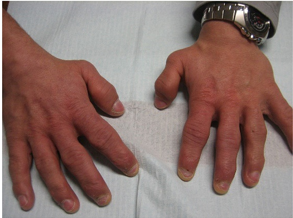
FIGURE 2: Our patient has broad thickened hands with stubby digits.