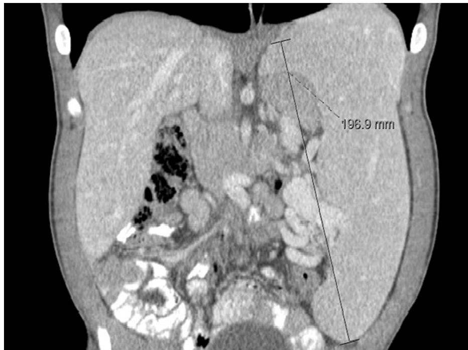
FIGURE 5: Abdominal CT-scan showing massive hepatosplenomegaly seen in our patient before treatment.