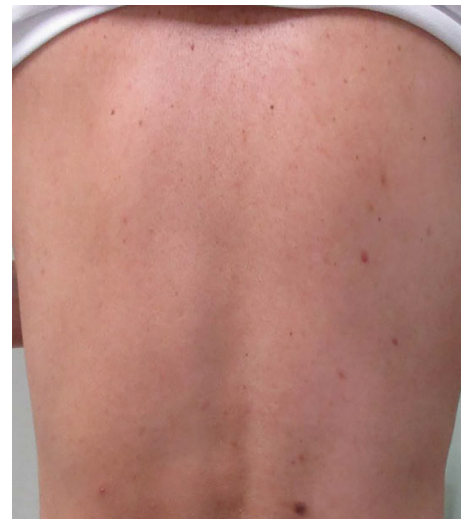
Figure 4. The skin examination findings after the treatment.

for Mycobacterium . Furthermore, a polymerase chain reaction (PCR) analysis of the third sputum sample showed Mycobacterium tuberculosis complex. In addition, a PCR analysis of his gastric juice also demonstrated Mycobacterium tuberculosis complex. The patient was therefore ultimately diagnosed with Addison's disease caused by tuberculosis and active pulmonary tuberculosis.