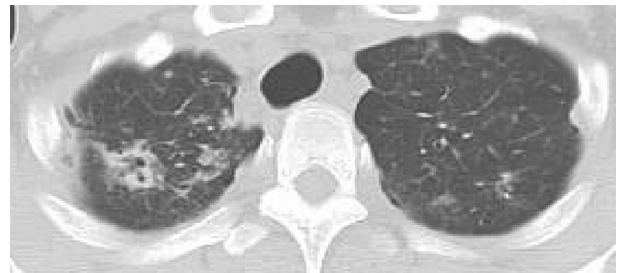
Figure 3. Non-contrast chest computed tomography image. Numerous centrilobular nodules with at least one small cavity were observed in both apical lung fields.