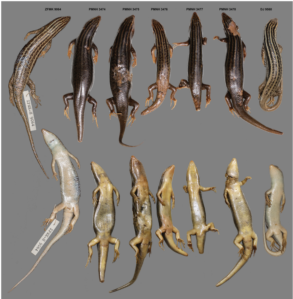
Figure 3. Dorsal and ventral views of adult specimens of Heremites septemtaeniatus transcaucasicus from Pakistan (PMNH 3474–3478 and DJ 9560), together with the only specimen of this species from Afghanistan (Dar-e-Nur, vic. Shewa, ZFMK-H 9064).

Stemmler, 1969, Eryx johnii (Russell, 1801), Naja oxiana (Eichwald, 1831), Oligodon arnensis (Shaw, 1802), Ptyas mucosa (Linnaeus, 1758), Platyceps cf. rhodorachis (Jan in de Filippi, 1865)].