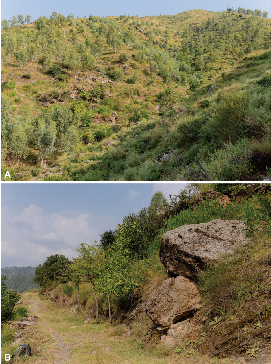
Figure 2. The habitat of Heremites septemtaeniatus transcausicus near Shah Alam Baba, Tehsil Adinzai, Lower Dir district, Khyber Pakhtunkhwa Province, Pakistan. Overall view of the locality ( A ), detail of the microhabitat ( B ).

Gray, 1845, Laudakia agrorensis (Stoliczka, 1872), L. pakistanica auffenbergi Baig & Böhme, 1996, Varanus bengalensis (Daudin, 1802)], and snakes [ Boiga trigonata (Schneider, 1802), Bungarus caeruleus (Schneider, 1801), Echis carinatus sochureki