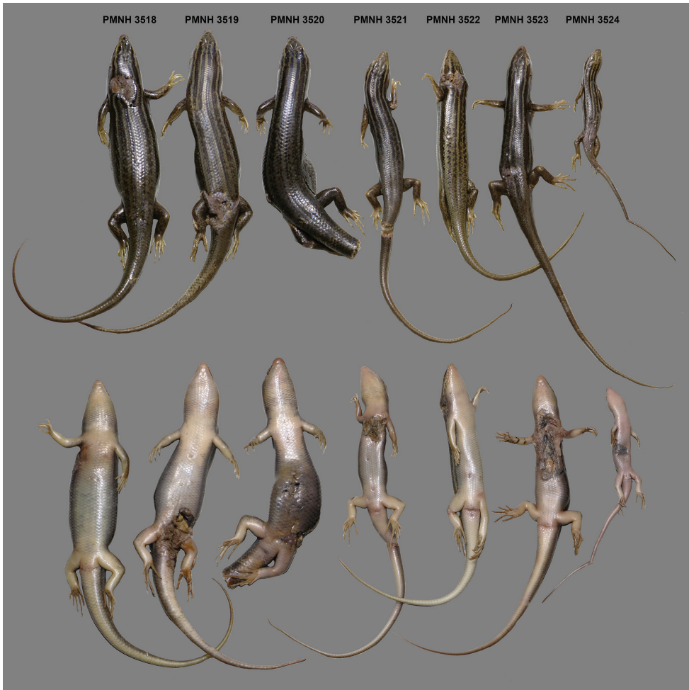
Figure 4. Dorsal and ventral views of adult and juvenile specimens of Heremites septemtaeniatus transcausicus from Pakistan (PMNH 3518–3524).

separated (25%); 35–42 scales around the widest part of the body; 62–69 ventral scales in transverse rows counted from gular to cloaca; 52–60 dorsal scale rows from first nuchal to above vent; each dorsal scale provided with three keels; olive-brown above, with four longitudinal dark brown stripes on head dorsum, breaking up into rhomboidal spots towards the middle of the back and continuing up to tail base; broad dark stripe, bordered above with white spots, arising from the nostril, passing along upper half of the flank, continuing onto tail; limbs brown with white speckles (see Table 1).