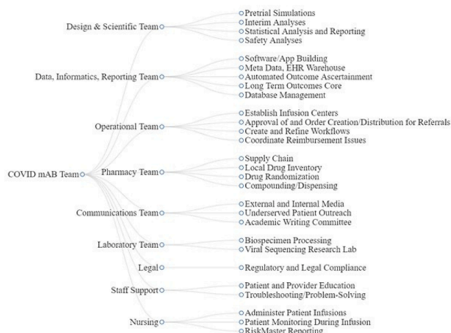
Fig. 2. COVID-19 monoclonal antibody team.

Data and analytics teams are key to sustainable and scalable implementation of multicenter platform trials. The embedding of the trial next to the EHR and routine care enhanced enrollment and allowed for rapid