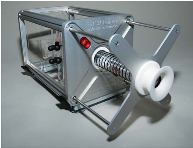
► Fig. 1 The Boškoski-Costamagna ERCP Trainer.