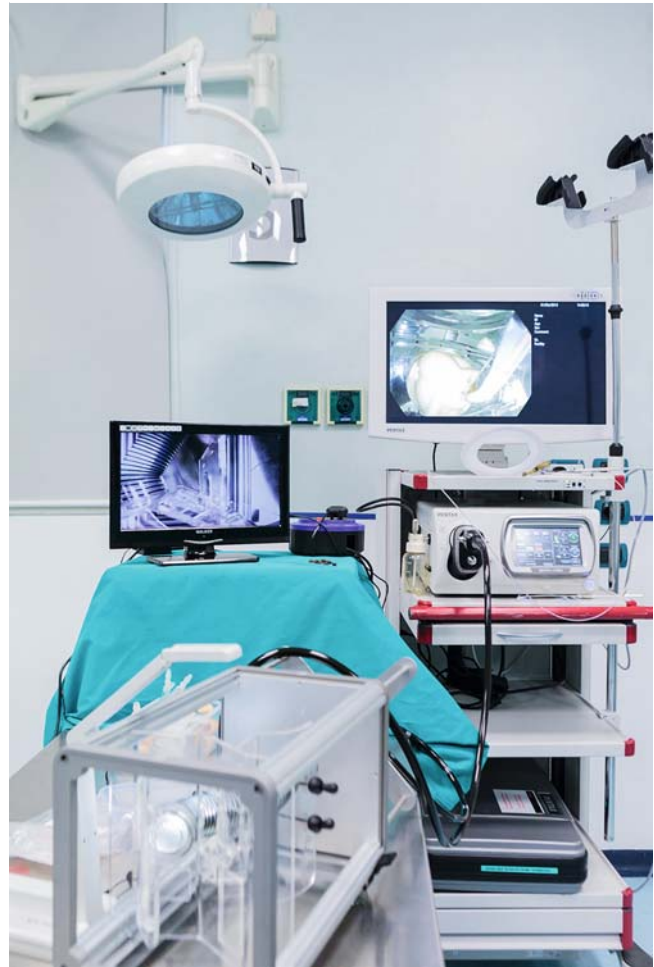
► Fig. 3 Complete simulator set-up.

All participants were invited for a simulator session in a similar private conference room either in our hospital, during a national conference of the Dutch Society of Gastroenterology in spring 2016 or during Digestive Disease Week in May 2016. During the procedures the participants were assisted by five alternating endoscopy nurses from the Erasmus MC with broad experience in assisting ERCP procedures and good English conversation skills.