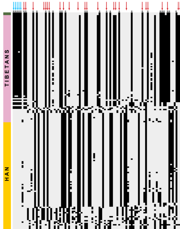
Figure 2. Haplotype pattern in a region defined by SNPs that are at high frequency in Tibet and at low frequency in the Han (see Table S3)

Each column is a polymorphic genomic location (95 in total), each row is a phased haplotype (80 Han and 80 Tibetan haplotypes), and the colored column on the left denotes the population identity of the individuals (Han in orange, Tibetans in pink). The top two rows (in dark green) are the haplotypes of the Denisovan individual. The dark cells represent the presence of the derived allele and the grey space represents the presence of the ancestral allele (see Methods). The first column corresponds to the first positions in Table S3 and the last column corresponds to the last position in Table S3. The red and blue arrows at the top indicate the 32 sites in Table S3. The blue arrows represent a five-SNP haplotype block defined by the first five SNPs in the 32.7kb region. The stars beneath the arrows point to sites where Tibetans share a derived allele with the Denisovan individual.