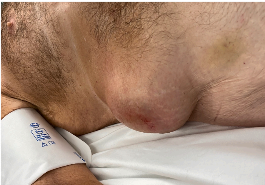
Fig. 1. Right lateral abdominal bulging mass noted on physical exam.

The common denominator in nearly all TAWH is the creation of an abdominal wall defect in the setting of direct or indirect blunt