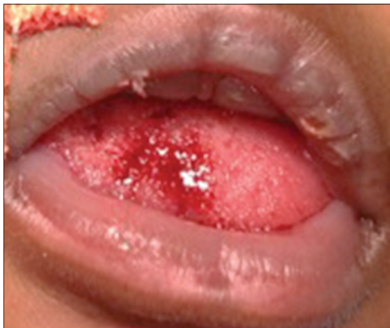
Figure 9: Glossopexy in case report 2 to alleviate airway compromise

the palate to the epithelium of the alveolar ridge or floor of the mouth. A commonly accepted theory proposed by Mathis in 1962 suggested that these fibrous bands to be remnants of the buccopharyngeal membrane. [1]