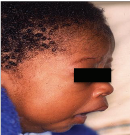
Figure 3: Preoperative lateral facial profile