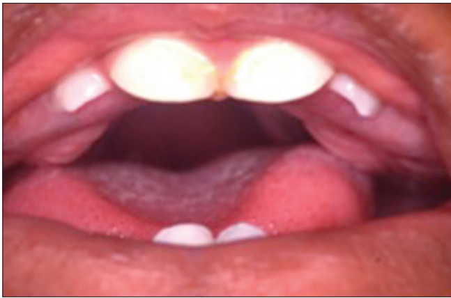
Figure 5: Posttransection mandibular catch-up growth