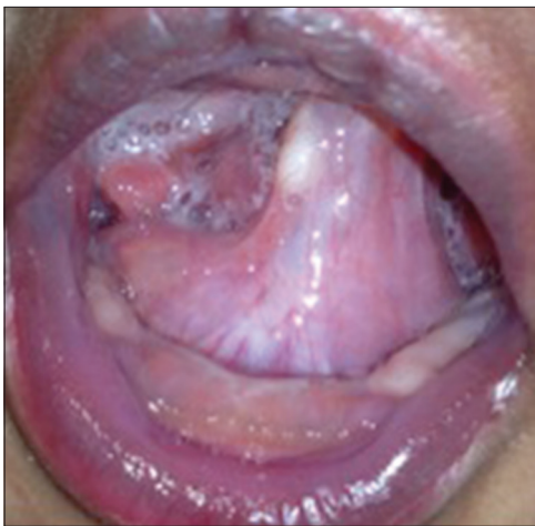
Figure 7: Oral synechia (central and left)