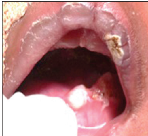
Figure 8: Immediate posttransection of the synechial band