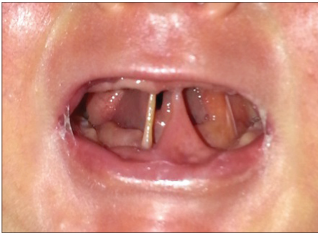
Figure 1: Oral synechia in popliteal pterygium syndrome