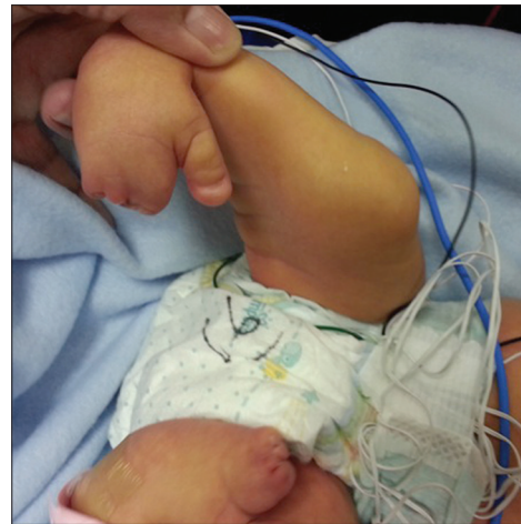
Figure 2: Limb deformities in a patient with popliteal pterygium syndrome and oral synechia