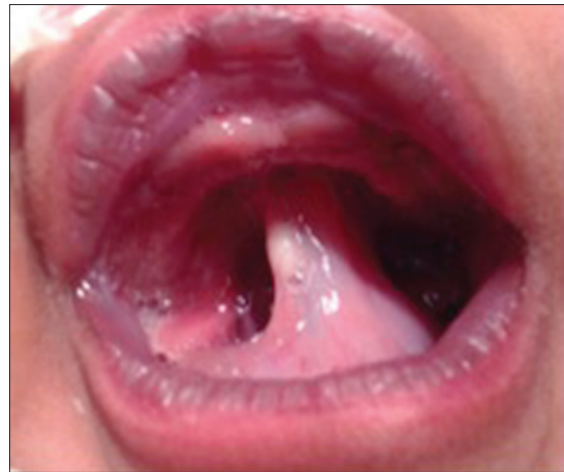
Figure 6: Oral synechia in case report 2