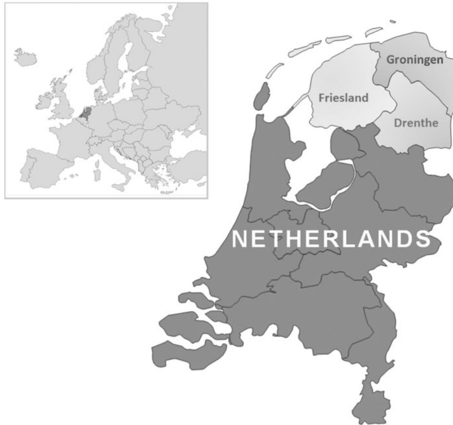
Figure 1 Location of study group (province of Groningen) and control group (provinces of Friesland and Drenthe) in the Netherlands

postal codes) and the count nature of the dependent variable (yearly count of contacts with a specific health problem per patient) were addressed in the statistical models.