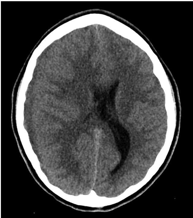
Fig. 1. Preoperative non-contrast computed tomography (axial view) demonstrating right temporo-parietal collection causing mass effect on the underlying cerebral parenchyma and ventricular system with midline shift to the left.