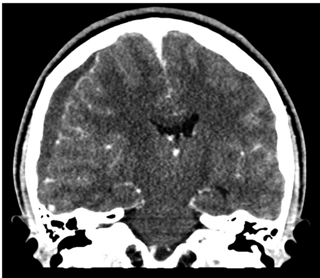
Fig. 4. Preoperative contrast-enhanced computed tomography (coronal view) demonstrating subtle enhancement of the subdural collection.

Benzylpenicillin, Clindamycin, Erythromycin, Vancomycin, Linezolid and Cefepime; the colonies were identified using the VITEK ® 2 (bioMérieux) bacterial identification system. The gram-negative rods failed to grow on any of the culture media, and blood cultures taken were also negative.