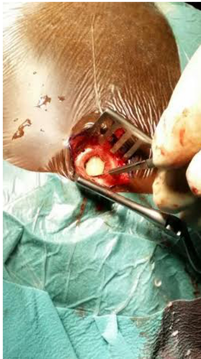
Fig. 5. Intraoperative photograph demonstrating yellow liquefied pus upon incision of the dura.

Agrawal et al. 1 in a review of SDE reported that in the neonate and infant population the most common source of primary infection was purulent meningitis, and in older children and adolescents it is usually due to direct extension from otorhinogenic causes such as middle ear or paranasal sinus infections, with other causes including spread from distant sites (such as the