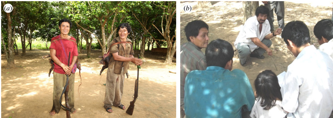
Figure 1. (a) Two Tsimane men returning from a hunt; (b) Tsimane man helping resolve a dispute over land, which is illustrative of the largely informal way in which political influence operates in this society. (Online version in colour.)

experience other advantages owing to their status [28]. Status can be self-reinforcing. Second, the status may motivate continued generosity, in order to signal that one's status is justified or one's leadership is trustworthy [29]. Such generosity on the part of high-status individuals may become normative, i.e. 'noblesse oblige' [30]. Third, cooperation by high-status individuals may motivate cooperation by other group members, owing to prestige-biased imitation [31,32]. Fourth, by forming cooperative partnerships with high-status individuals, group members elevate their own status by gaining access to high-status individuals' information [10], resources or coalitions.