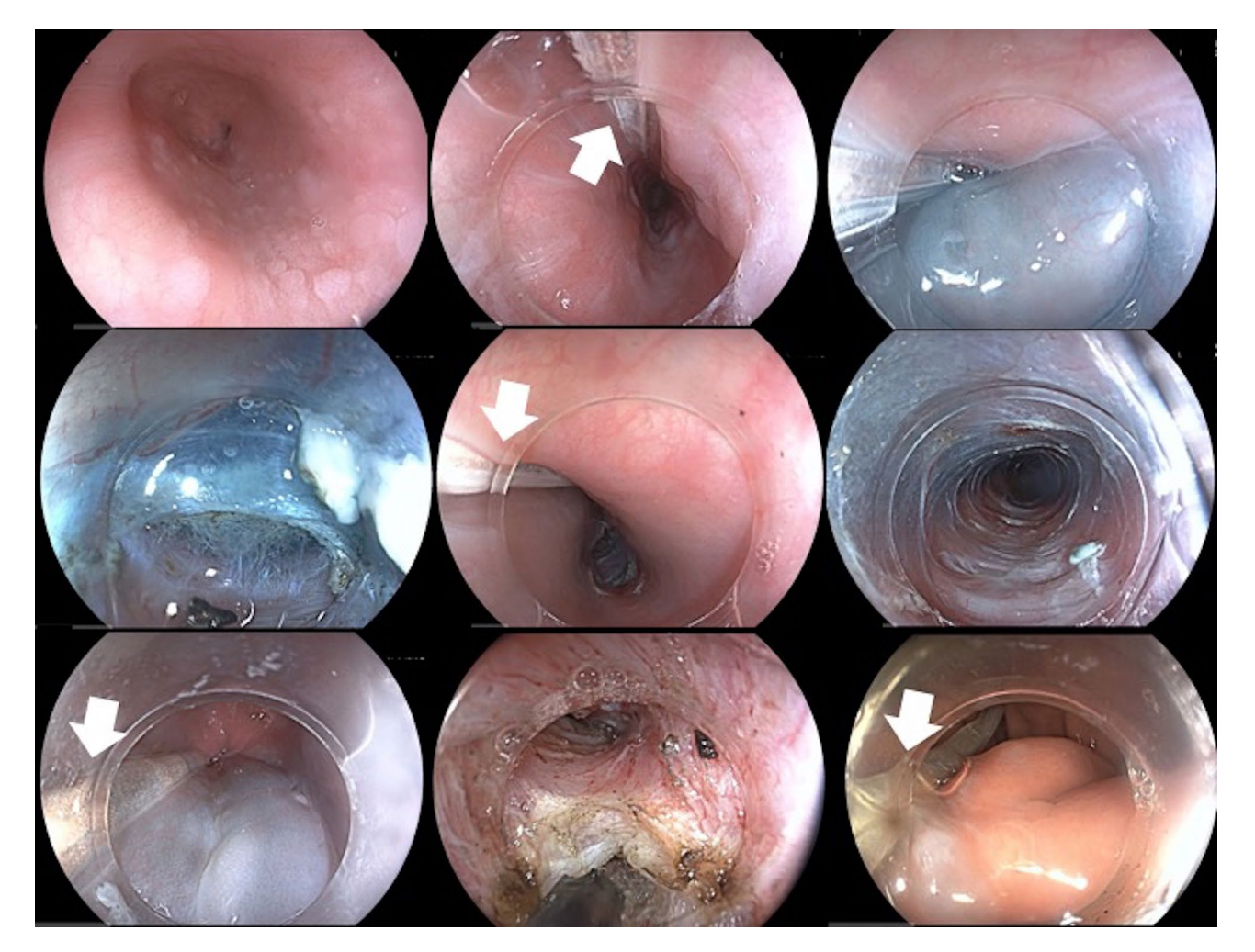
Figure 1. Endoscopic steps of the peroral endoscopic myotomy. Note the presence of the manometry catheter in the esophageal lumen during the whole procedure.

provided written informed consent for the procedure and the use of their data. The study protocol conforms to the ethical guidelines of the 1975 Declaration of Helsinki as reflected in a priori approval by the institution's human research committee (The Ethical Review Committee for publications of the Cochin University Hospital (CLEP) : n°AAA-2018-08008).