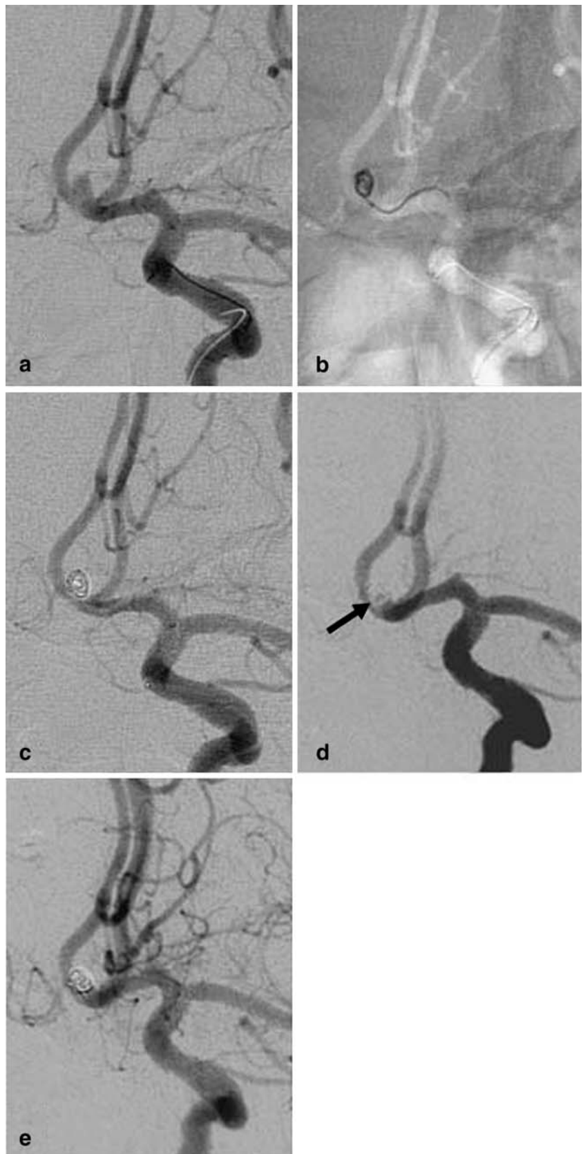
Fig. 2 Patient 5. a Angiogram of the left ICA shows a tiny ACoA aneurysm with a maximum diameter of 2.5 mm. b Unsubtracted image of the skull obtained with the road-mapping technique during treatment. Embolization was with a GDC-10 Soft coil measuring 2×60 mm. c Angiogram of the left ICA obtained at the end of the procedure shows complete occlusion of the aneurysm. d Angiogram of the left ICA obtained at the 3-month follow-up shows minor recanalization of the neck ( arrow ). e The minor neck filling was stable at the 48-month follow-up