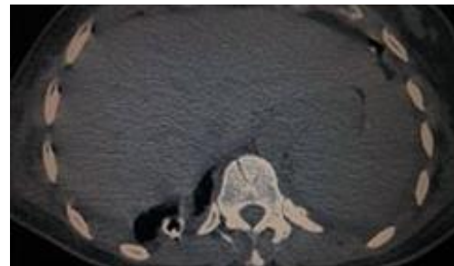
Figure 6: Axial view of computed tomography scan of the patient's chest showing 11 th thoracic vertebral body fracture

saturation (O 2 sat) = 82% with face mask. On the clinical bases, bilateral thoracostomy drains were inserted. Chest x-ray was inconclusive. Computed tomography scan of the chest and neck showed eight rib fractures on left side, six rib fractures on the right side, sternal dislocation and manubriosternal fracture (figure 2, 3), fracture of 5 th and 7 th cervical vertebrae (figure 4), left side hemothorax (figure 5), fracture of body of 11 th thoracic vertebrae (figure 6). After imaging, the patient was transferred to ICU and intubated as the oxygen saturation decreased. Percutaneous jejunostomy was applied for feeding. Tracheostomy was done eight days after endotracheal intubation. The patient remained in intubated state in ICU for 18 days, four days later the patient was discharged from ICU and she was admitted in ward for one week and discharged from the hospital with good health 23 days after admission.