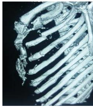
Figure 3: 3D computed tomography scan of the patient's chest showing sternal fracture