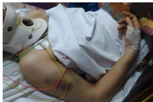
Figure 1: Patient's general appearance shows multiple ecchymosis all over the body

A 47-year-old female, mother of 4 children, presented to emergency room (ER) at 2.00 am with chest pain, disturbed level of consciousness, shortness of breath and multiple patches of skin discoloration. On examination the patient was semi-conscious, multiple ecchymosis was found all over body (figure 1), bilateral good air entry. On arrival vital signs were as follow: blood pressure (BP) = 120/80 mmHg, pulse rate (PR) = 102/min, respiratory rate (RR) = 18/min, and oxygen