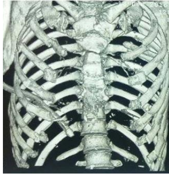
Figure 2: 3D computed tomography scan of the patient's chest showing multiple rib fracture on both sides