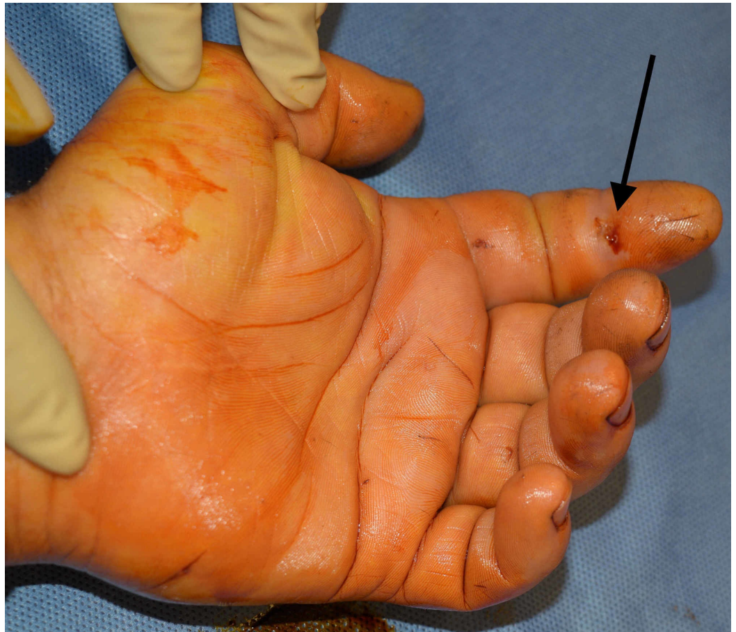
FIGURE 1: Preoperative photograph of left index finger demonstrating site of penetrating injury.

Black arrow points to the exact location of the penetrating injury.