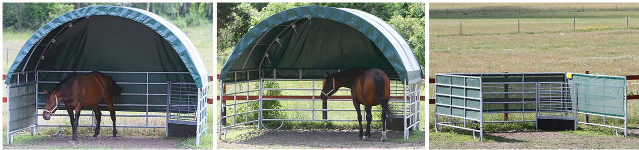
Fig. 2 Closed shelter A (left with opaque plastic roof, opaque plastic on the rear wall opposite the entrance and transparent wind nets on two sides, open shelter B (middle with opaque plastic roof and opaque plastic covering the upper half of the rear wall), and shelter C without roof (right wind nets on three sides). Shelters were purchased from Mobile Covers (Cover all Europe GmbH, Groß Lüdershagen, Germany) and measured 4 × 4 m (height 3.15 m). The fence elements consisted of 2 mm thick round steel (45 mm in diameter) and the distance between fence elements was 21.5 cm (first bar at 23 cm off the ground). The height of the walls measured 130.5 cm. The roof was a polyvinyl chloride fabric (670 g/m 2 ). Sticky paper traps were placed in the right corner in each shelter behind a metal gate.

and 0200 to 0600 h (surveillance camera, Qihan Technology Co., Ltd., China) and during daytime from 0900 to 1200 h and 1300 to 1600 h by two observers sitting outside the paddocks at a distance of 30 m. Other behaviour, including shelter use was recorded via direct observations at 5 min intervals according to the ethogram in Table 1.