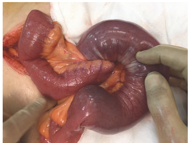
FIGURE 2. Intraoperative appearance of ileoileal invagination.

sion complaints included abdominal pain, nausea, vomiting, and inability to defecate or pass gas, and in remaining patient (10.2%) lower gastrointestinal (GIS) system bleeding was detected. In the 2 patients who were operated on under elective conditions, the primary complaints were abdominal pain, lassitude, and anemia. Diagnosis was established in the 1 (1.9%) patient with lower GIS bleeding using angiography, while 6 (60%) of the remaining 10 patients were diagnosed on the basis of US and/or CT findings (Figure 3). All patients underwent surgery: right hemicolectomy-ileotransversostomy (n=5; 45.5%) or segmental resection of small bowel