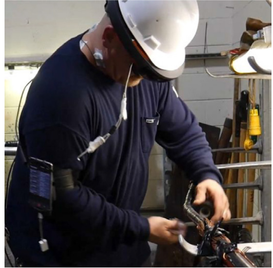
Figure 3. Manhole worker hand taping a splice while wearing the HMT-1. A cell phone attached to his right arm recorded data from the eye camera while the worker did the task.

The first phase was conducted in a large two-unit coal-fired electric utility power plant located in the Midwestern United States. A major part of a power plant operator’s job is to check the status of over 200 pieces of equipment in a 10