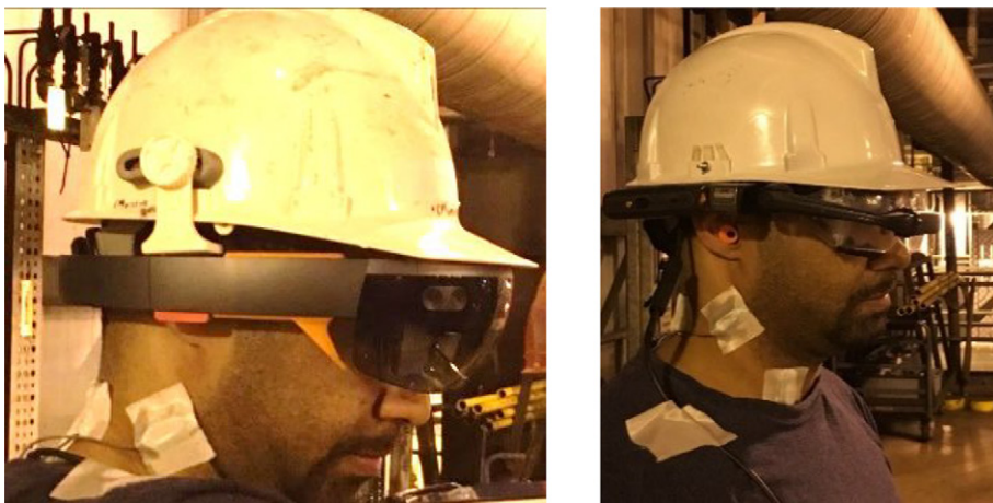
Figure 1. Left: HoloLens worn by utility worker. Right: RealWear HMT-1 worn by worker. The small display is mounted to the side of the right eye. The worker wore safety glasses, and an eye camera was located under the right pane of the safety glasses.

The HoloLens has the capability for a worker to communicate with a hand gesture (air tap) or speech recognition via voice input. The air tap method, which consists of placing the index finger in front of the HoloLens at arm length and then moving the index finger to the thumb to tap, was used in the present study for both groups of workers (Figure 2). Speech recognition for the first-generation HoloLens was reported to be problematic (Strange, March 12, 2019) and was corroborated with testing in the power plant. For