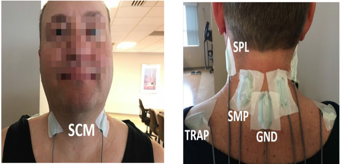
Figure 4. Left: Locations of sEMG electrodes on the right and left sternocleidomastoid (SCM). Right: Locations of sEMG electrodes on the right and left trapezius (TRAP), splenius (SPL), and semispinalis capitis (SMP; from lateral to medial). The center electrode served as the reference ground (GND), which was located on the first thoracic transverse process.

to the HoloLens with the binocular add-on made by Pupil Labs, and for the HMT-1 and “No AR” conditions, the camera was mounted to a 3D-printed frame made by Pupil Labs. The camera recorded blink rate of the right eye of all subjects, regardless of eye dominance. Blink rate data were stored on a cell phone that was strapped to the subject’s right arm (Figure 3), and the data were subsequently transferred to a PC.