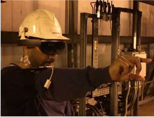
Figure 2. Plant operator gesturing with “air taps” to communicate with the HoloLens before inspecting equipment.

two workers (male and female), 90% of verbal commands to the HoloLens were not transmitted successfully in the power plant, which had a noise level ranging from 81 to 84 dBA.