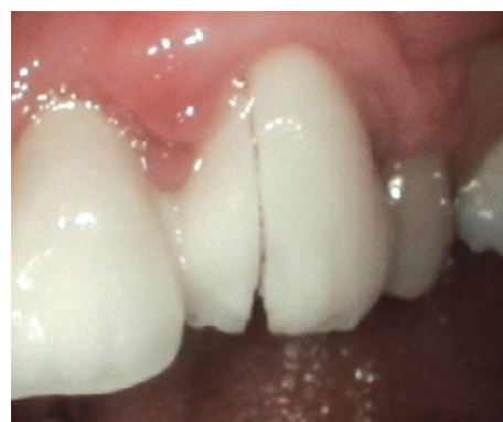
FIGURE 2: Core fracture found in a six-unit zirconia FDP after one year in situ.