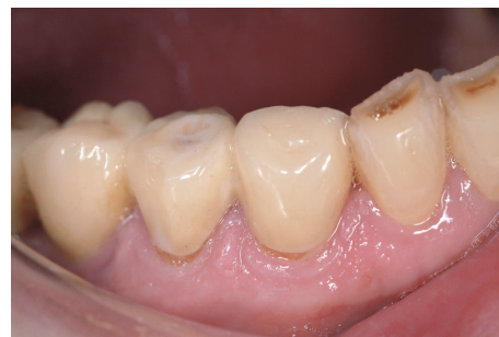
FIGURE 3: Adhesive fracture during first year due to severe attrition. This FDP was remade.

fracture was seen in a six-unit (five abutments and one pontic) anterior FDP on a bruxist patient (Figure 2). The second core fracture occurred in the median line of a seven-unit (teeth 16-21) FDP.