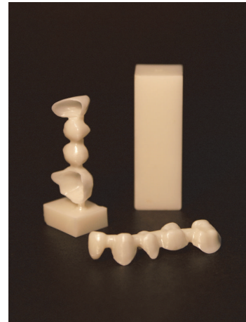
FIGURE 1: Right. Zirconia blank. Left. Direct from machining of FDP framework. Front. Zirconia FDP framework designed using a CAD program, ready for veneering (Denzir, Cad.esthetics AB, Skellefteå, Sweden).

Of the 458 abutment teeth, 167 were root filled and 134 were treated with posts (48 with indirect technique and 86 with direct technique) before the cementation of FDP.