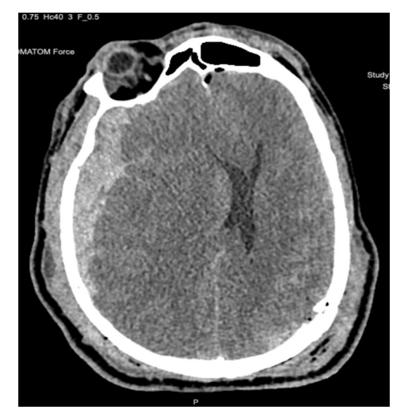
Figure 1 CT of the head revealing right subdural hematoma with midline shift.

In a patient with polytrauma, the neurological examination can be confounded by ongoing hemorrhagic shock. Although circulatory support remains a key part in the primary resuscitation of patients in extremis, eFAST is an important adjunct