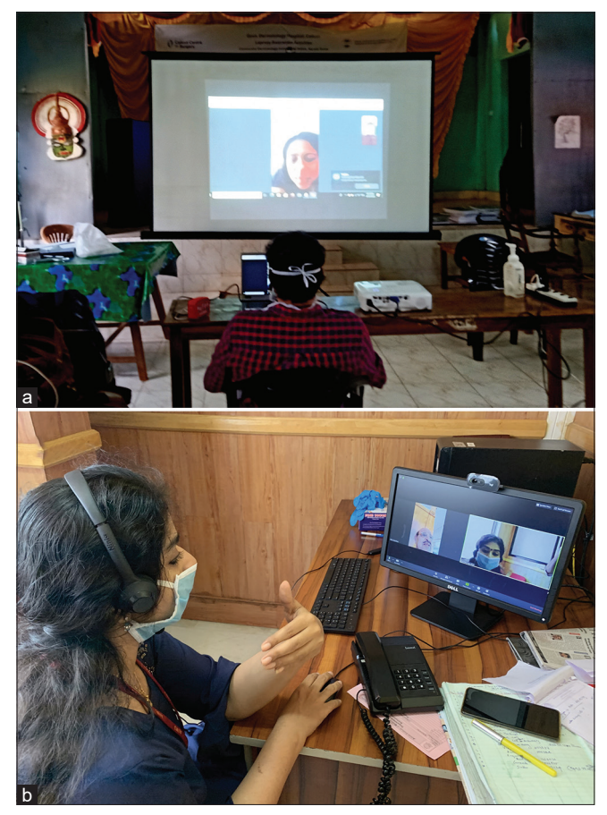
Figure 1: (a) Teledermatology consultation using Google Duo application-based video calls being carried out with projection on a large screen. (b) Teledermatology consultation using Zoom Application projected on a computer screen

2. Trained assistant (located in the remote location) operated system which also works in the same lines