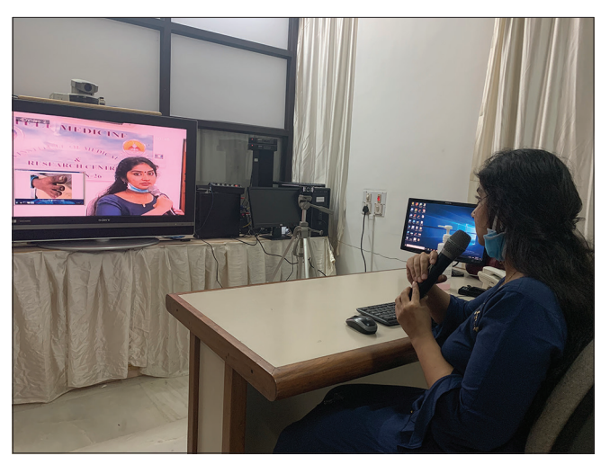
Figure 4: Teledermatology set up at a tertiary care referral hospital