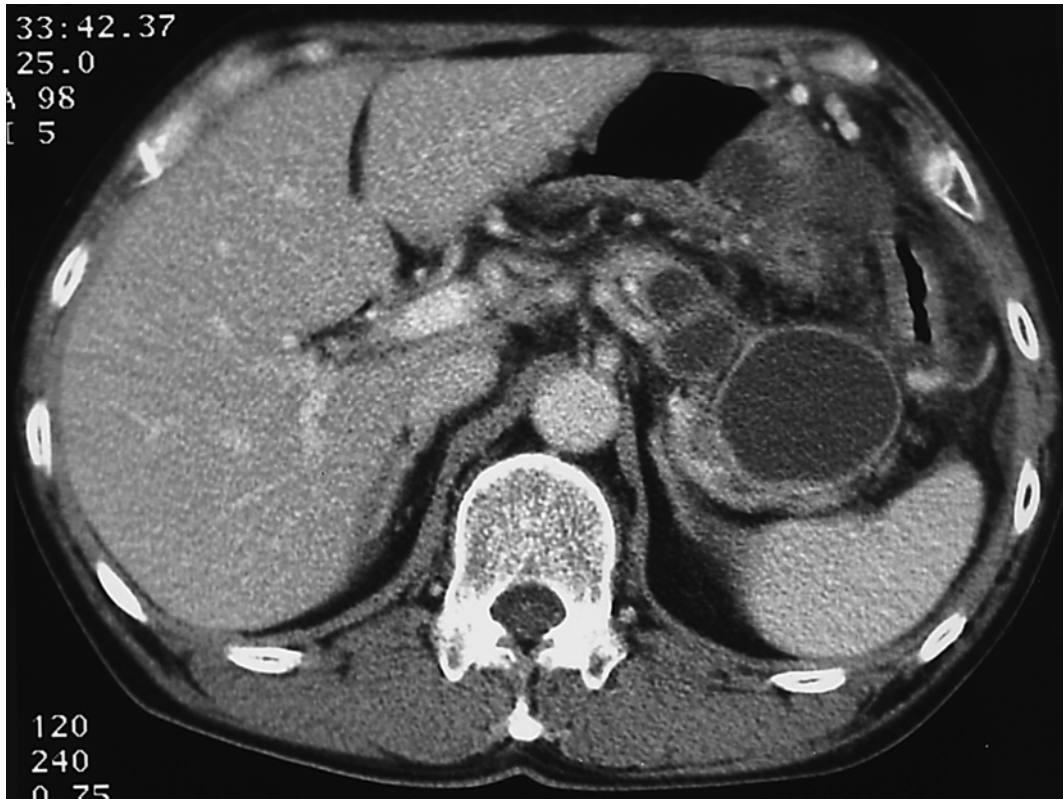
Fig. 1. CT showed a large pseudocyst measuring 5 cm in diameter and some small cysts in the pancreatic tail.