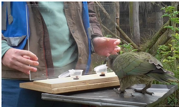
Figure 2. Kea subject performs calculated contrafreeloading during a test trial.

diets but were all readily accepted and eaten at least ten times in a row by all individuals in tests prior to this study. As per preference tests also conducted prior to this study, fat cubes were determined to be the favourite food for all subjects, hazelnuts to be intermediate in value, and sultanas to be the lowest value food; subjects chose based on these preferences in 96.5% of food preference trials. All food items used within each experiment were of equivalent size and presented in 2-oz transparent plastic cups with removable transparent lids. The cups were attached to a small wooden board (45 cm × 13 cm × 1.5 cm) behind a Plexiglass screen (45 cm × 30 cm × 3 mm), which was removed so that subjects could make a choice and was then replaced after subjects selected one of the two cups (Fig. 2). The research was carried out with approval from the University of Auckland ethics committee (Reference Number 001816) and all methods were carried out in accordance with the relevant guidelines and regulations. The study was carried out in compliance with ARRIVE guidelines, which ensure ethical, transparent, and reproducible research with animal subjects 55 .