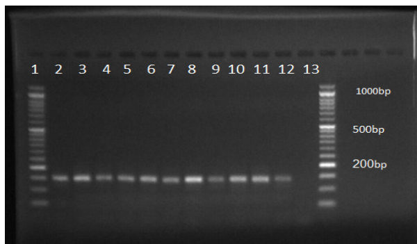
Figure 1. PCR Analysis of DNA Samples Extracted Paraffin Embedded Tissues Using HPV GP5+GP6+primers: lane 1, DNA Size marker; lane 2-11, HPV positive samples; lane 12, positive control; lane 13, negative control