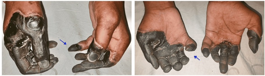
FIGURE 1: Dry gangrenous changes in both hands.

Neurological examination of extremities revealed hand muscle weakness with grade 0/5 power and loss of sensation on the gangrenous area while in the rest of the hand sensation was intact. However, the nerve conduction study was normal. His blood investigations were within normal limits. Examination of the remaining systems was unremarkable. On coupling his signs and symptoms the diagnosis of upper limb ischemia due to TAO was made. Further assessment using CT-angiography showed occlusion of ulnar arteries bilaterally with uneven opacification of palmar and digital arteries (Figures 2A-2C).