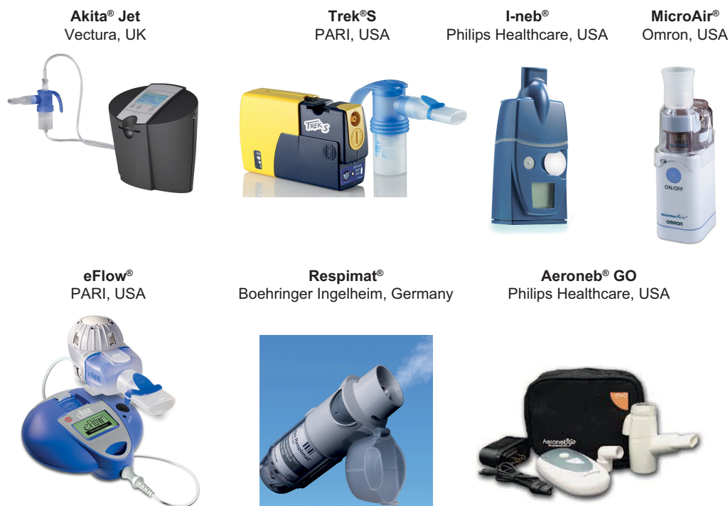
Figure 1 Examples of commercially available nebulizers that incorporate newer aerosol generating technologies.

Notes: Akita® Jet (Courtesy of Ventura, UK) and the I-neb® (Courtesy of Philips Healthcare, USA) employ AAD technology to deliver and monitor nebulizer treatments. Trek® S (Courtesy of PARI, USA; Trek® S is a trademark of PARI GmbH and its affiliates) is a portable jet nebulizer. MicroAir® NE-U22 (Courtesy of Omron, USA) and the eFlow® (Courtesy of PARI, USA; eFlow® is a trademark of PARI GmbH and its affiliates) are vibrating mesh aerosol nebulizers. RespiMat® is a high-efficiency soft mist inhaler (Reproduced with permission from Boehringer Ingelheim Pharmaceuticals, Inc. RespiMat® is a trademark of and/or used under license from Boehringer Ingelheim International GmbH or its affiliated companies. Materials may also be subject to copyright protection). Aeroneb® Go (Courtesy of Philips Healthcare) is an ultrasonic nebulizer. All of these devices are approved for use in the US.