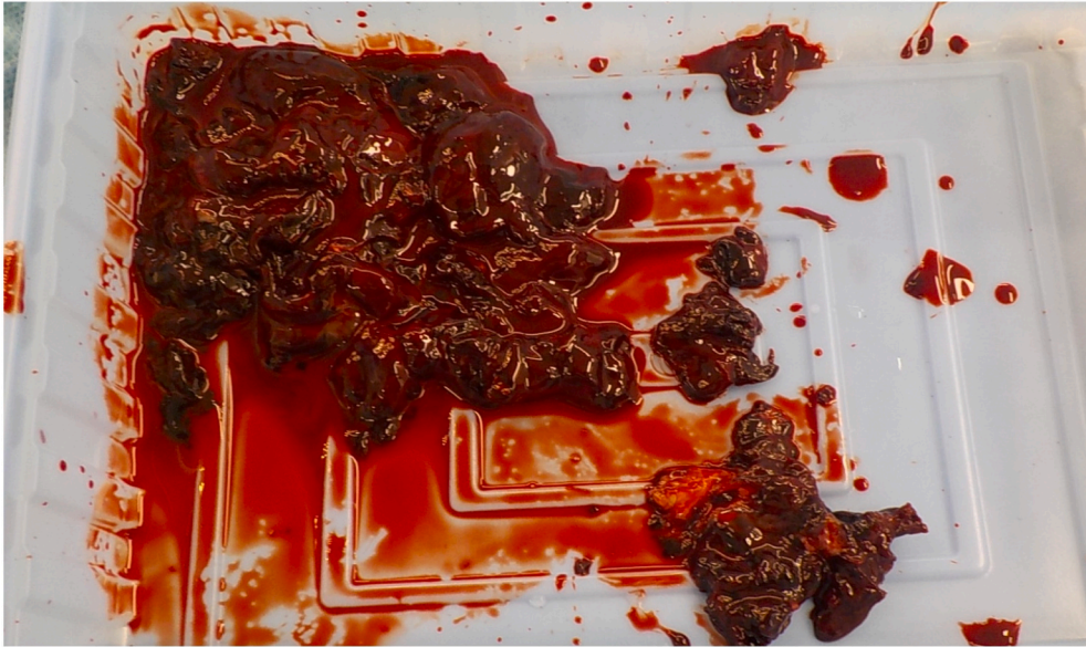
Fig. 2. Subcutaneous hematoma taken from the medial compartment.