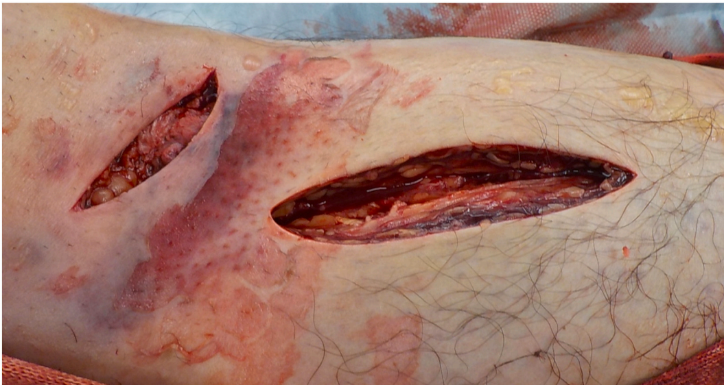
Fig. 3. Medial fasciotomy to release the medial leg compartment.