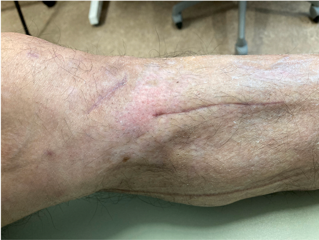
Fig. 4. Postoperative wound 2 weeks after surgery.

especially when a pneumatic tourniquet is not applied and the patient is placed under general anesthesia. Despite its rarity, surgeons should consider compartment syndrome as a differential diagnosis for patients with symptoms matching the 6Ps after ACL reconstruction.