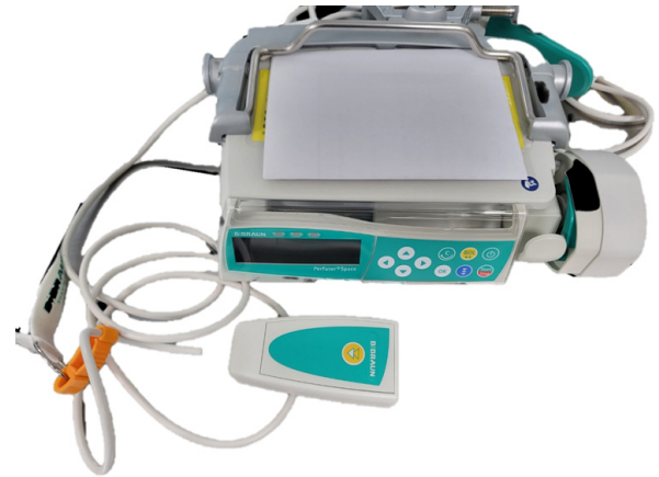
Fig. 1. A patient-controlled sedation device used for remimazolam infusion (Perfusor Space, B.Braun Mesungen AG, Germany).

numeric rating scale (NRS) score for surgical site pain was 0. Consequently, the dental anesthesiologist and oral surgeon concurred that performing the surgery under PCS