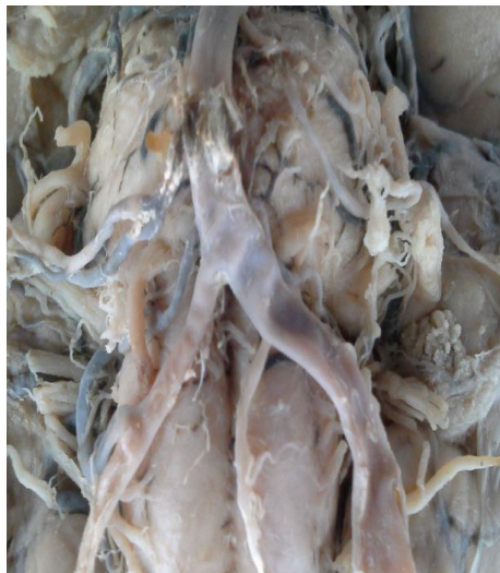
(c) Hypoplasia of RVA. Note that calibre RVA is less than half that of LVA