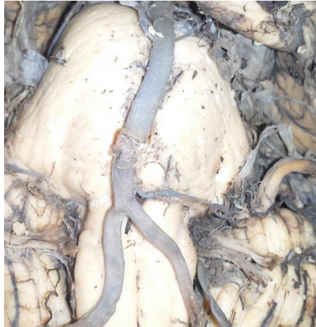
(a) Symmetrical vertebral arteries uniting to form basilar artery. Note the equal size of the vertebral arteries