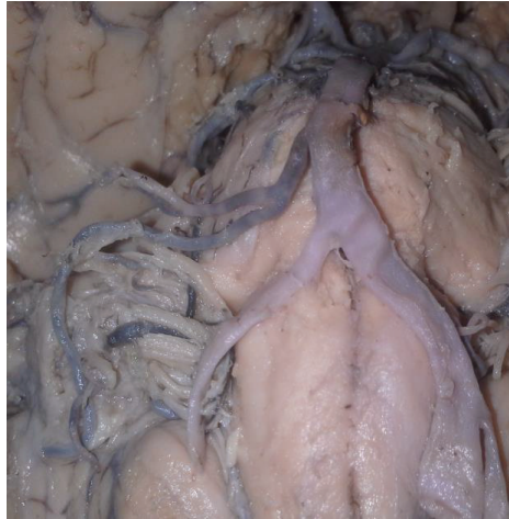
(b) Bilateral asymmetry with mild hypoplasia of right vertebral artery. Note the relatively smaller RVA compared to LVA