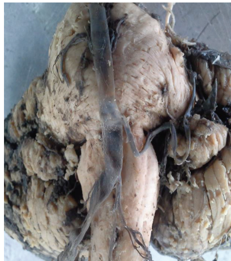
(d) Severe hypoplasia of the LVA. Note the obviously attenuated LVA relative to the normal RVA