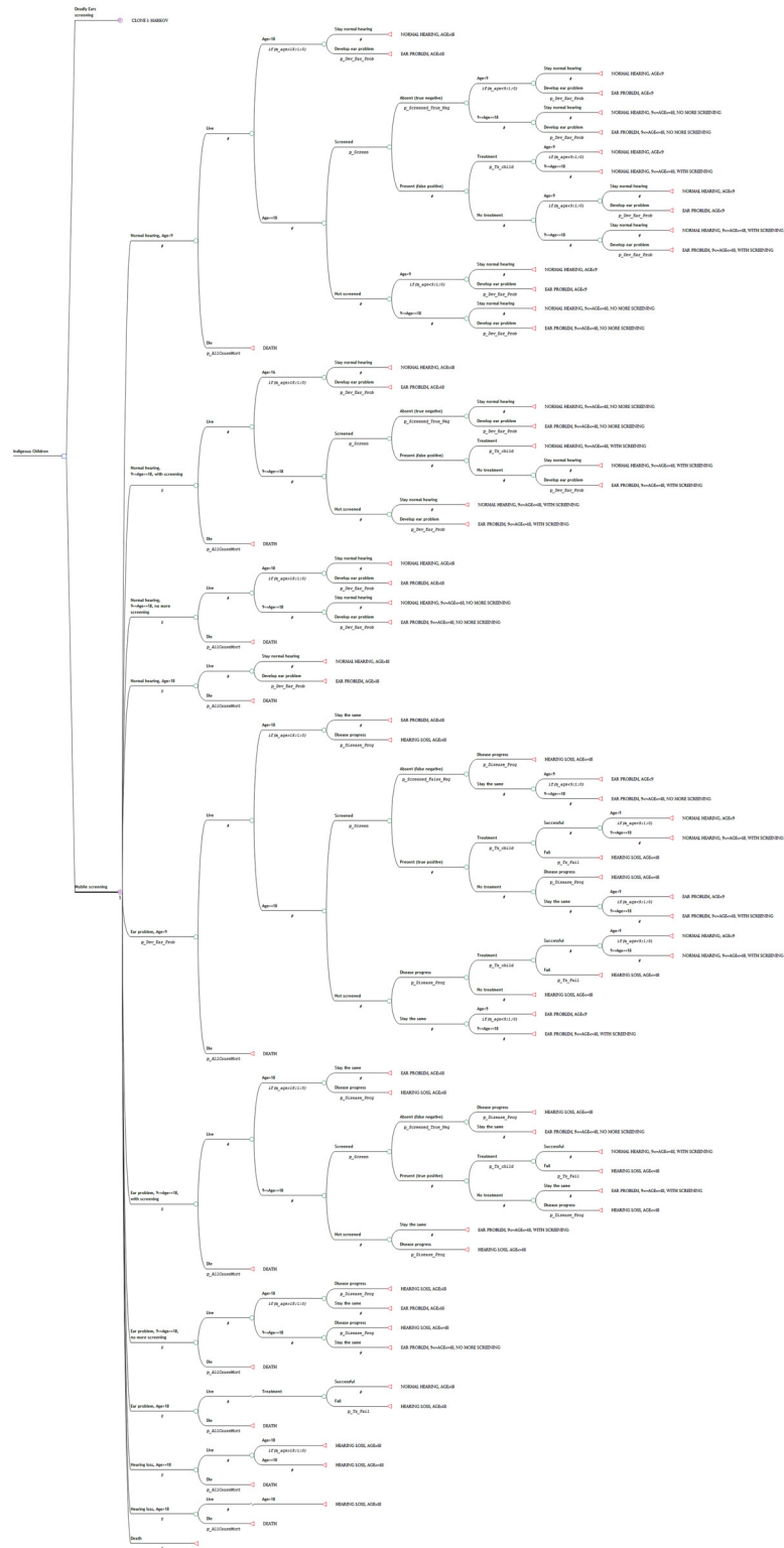
Fig 1. Markov states used for each of the options analysed in the decision analytic model.